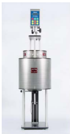
Molten Glass Viscosity as a Function of Temperature

(Rotating Spindle Viscometer – for ASTM C-965 Procedure A)